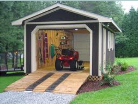
Residential Storage Shed

Santa Rosa County Board of County Commissioners adopted Ordinance 2010-17 on July 8th, 2010. The ordinance allows construction of a residential storage accessory building without a building permit meeting the following criteria: